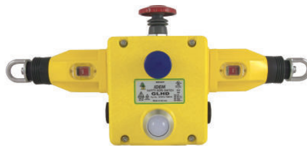
Low temperature version -40C available GLHD-FZ