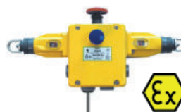
Pre-wired EX versions (see Explosion Proof section)

Standards: EN60947-5-1 EN60947-5-5 EN62061 UL508 ISO13850 ISO13849-1